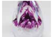
Amethyst & White