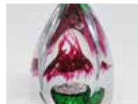
Ruby & Emerald