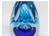
Sapphire & Turquoise