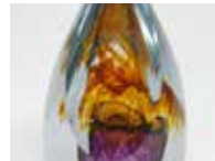
Amethyst & Gold